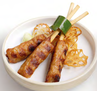
越式烤肉串 | 3串 $38 Grilled Skewers | 3 pcs