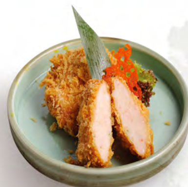
越式炸蝦餅 | 2件 $48 Deep-fried Prawn Cake | 2 pcs