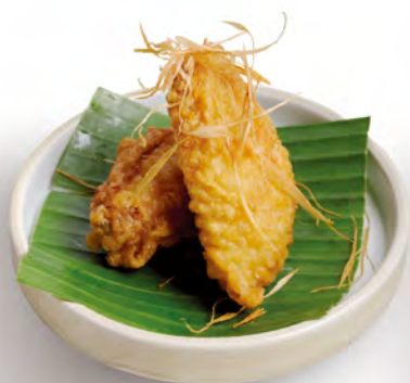
香茅炸雞翼 | 2隻 $38 Lemongrass Chicken Wings | 2 pcs