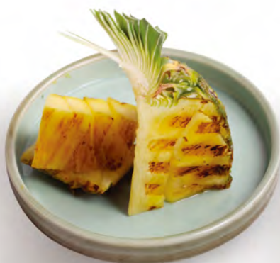
燒菠蘿 | 1件 $38 Grilled Pineapple | 1 pc