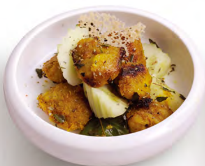
沙嗲豬肉 $48 Grilled Satay Pork