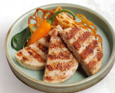
燒厚切豬耳扎肉 | 3件 $36 Grilled Vietnamese Pig Ear Sausage | 3 pcs