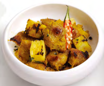
沙嗲雞肉 $48 Grilled Satay Chicken