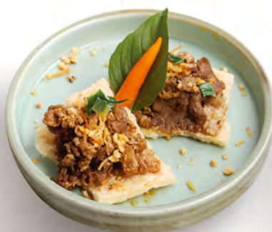
燒牛肉蝦片 | 2件 $38 Roasted Beef with Lemongrass on Prawn Crackers | 2 pcs