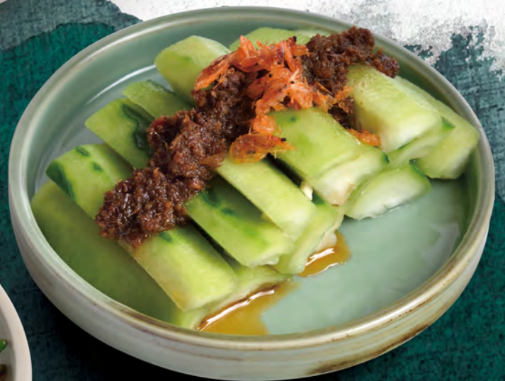
馬拉盞灼勝瓜 $46 Luffa with Belacan