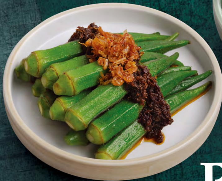
馬拉盞灼秋葵 $46 Okra with Belacan