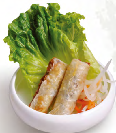
越南炸春卷 | 2件 $38 Deep-fried Spring Roll | 2 pcs