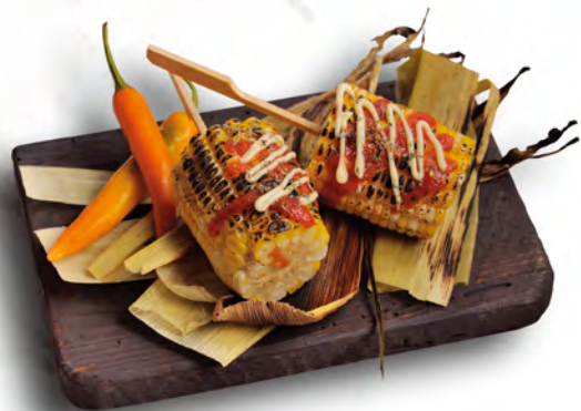
是拉差燒粟米 | 2件 $38 Grilled Corn in Sriracha Sauce | 2 pcs